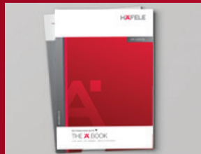
The A Book NZ Market Specific Furniture Fittings