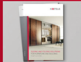
Sliding and Folding Solutions For Furniture and Building