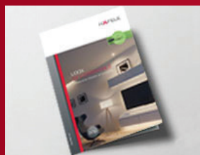
LOOX 24V Essentials