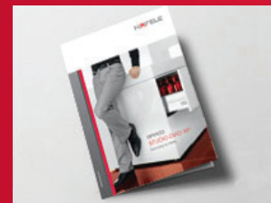
Grass STUDIO Drawer