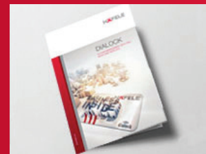
DIALOCK Electronic Access Control