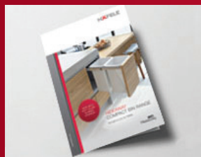
HIDEAWAY Waste Bin Range