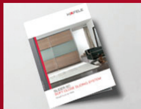
SLIDER SC Fittings