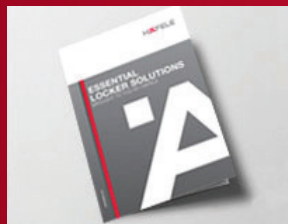
Essential Locker Solutions