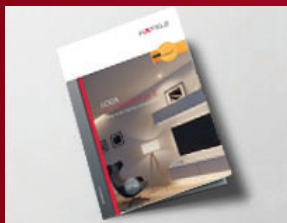
LOOX 12V Essentials