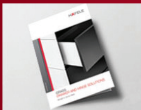
Grass Drawer and Hinge