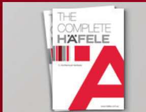
The Complete Häfele ARCHITECTURAL