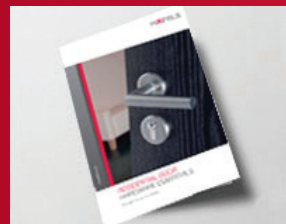
Residential Door Hardware Essentials