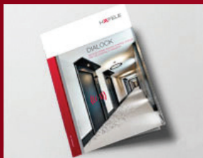
DIALOCK Electronic Access Control for Hotels