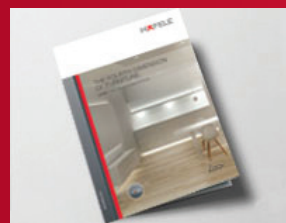
LOOX Lighting Range