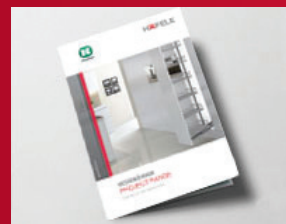
KESSEBOHMER Project Range