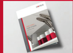
FREE Family Flap Fittings