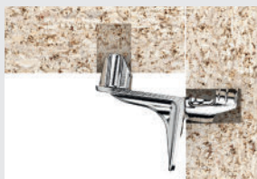
2) Fit shelf