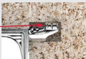
4) The twin grooves drill themselves into the wood. Greater stability is achieved