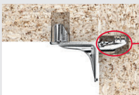
3) The weight of the shelf makes the arm lie flush against the side panel